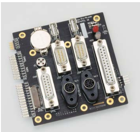
Figure 3: MZ104+UTIL Utility Connector Board

The MZ104+UTIL interfaces to the MZ-6SER CPU module via three ribbon cables and one flex-foil cable. The MZ104+UTIL can be mounted above the MZ-6SER with PC/104 stand offs.