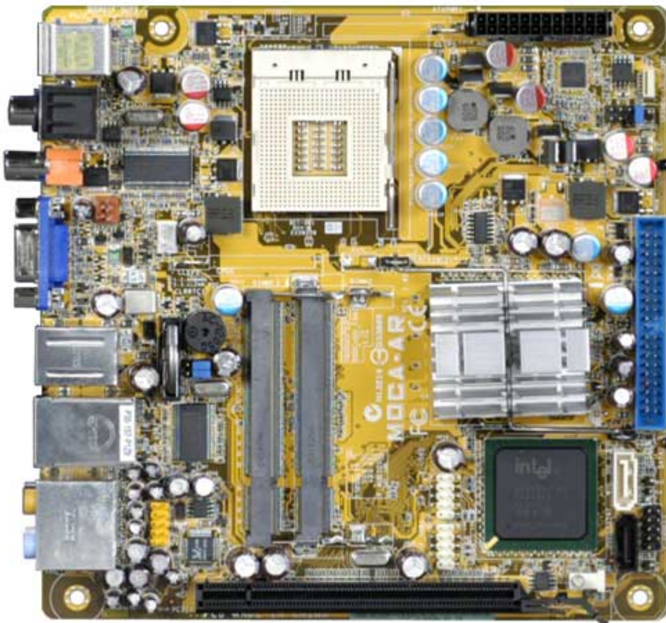
Figure 1: The MOCA-AR (Calcite) motherboard