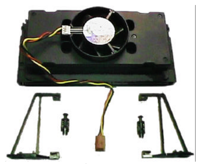
Figure 4:Boxed Pentium® II Processor & Heat sink support