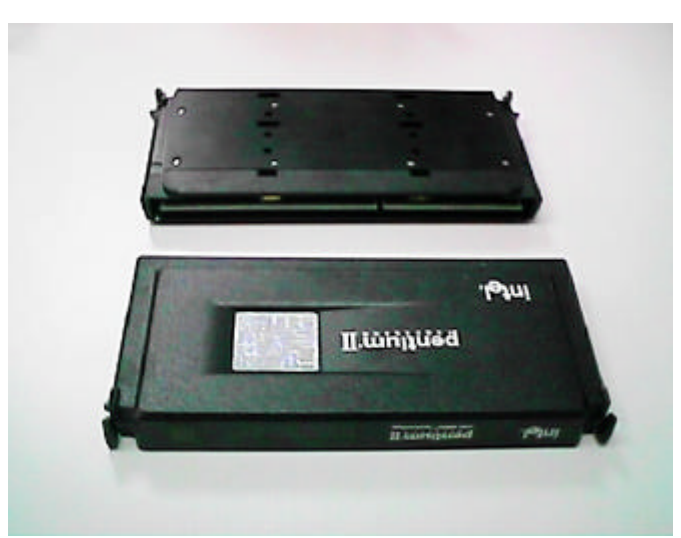
Figure 2:OEM Pentium® II Processor