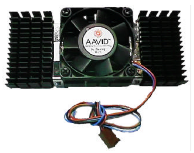
Figure 3:Heatsink / FAN & Heat sink support for OEM Pentium® II Processor