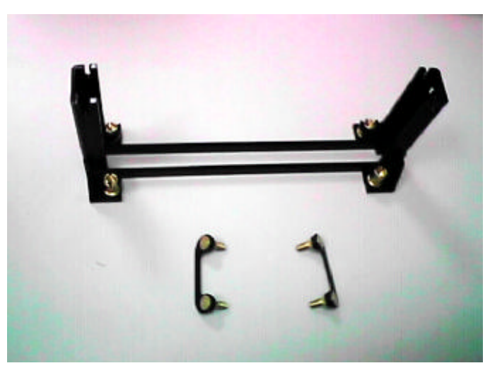
Figure 1:Retention Mechanism & attach Mount