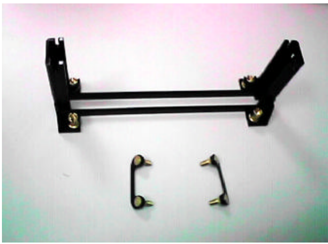
Figure 1:Retention Mechanism & attach Mount