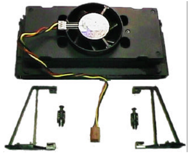
Figure 4:Boxed Pentium® II Processor & Heat sink support