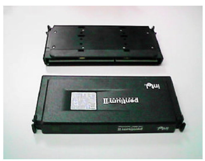
Figure 2:OEM Pentium® II Processor