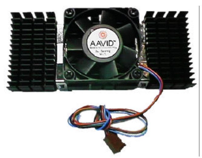
Figure 3:Heatsink / FAN & Heat sink support for OEM Pentium® II Processor