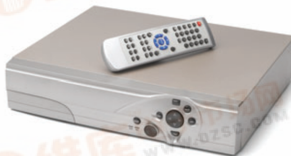
Example Application: DVR