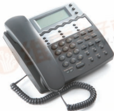
Example Application: IP Phone

The 88E1121R can operate with just two voltages, 1.2V for the core and 1.8V/2.5V/3.3V for I/O. It consumes only 700 mW per port and features energy detect and energy detect+™ low-power modes. It supports data terminal equipment (DTE) power function for Power over Ethernet (PoE) applications. The device also incorporates the advanced Marvell Virtual Cable Tester® (advanced Marvell VCT™) feature for remote identification of potential cable malfunctions, thus reducing equipment returns and service calls. Housed in a 100-pin TQFP package and measuring only 16mm x 16mm on each side, the 88E1121R is the smallest dual-port Gigabit Ethernet PHY on the market.